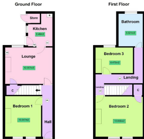
8 Lymore Gardens, Bath