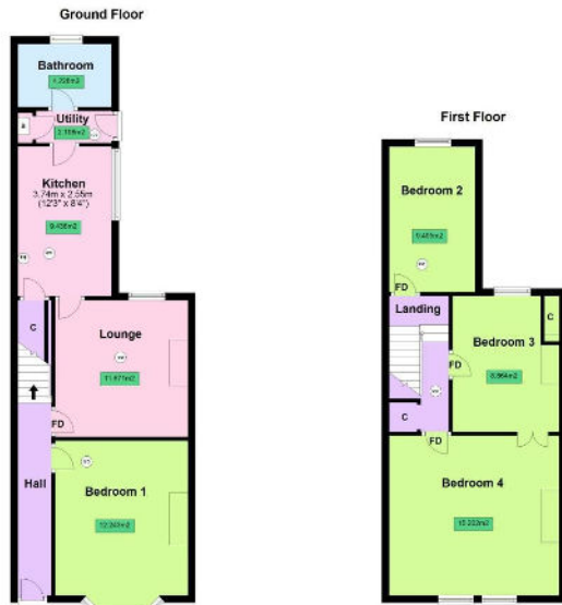
42 Faulkland Road, Bath