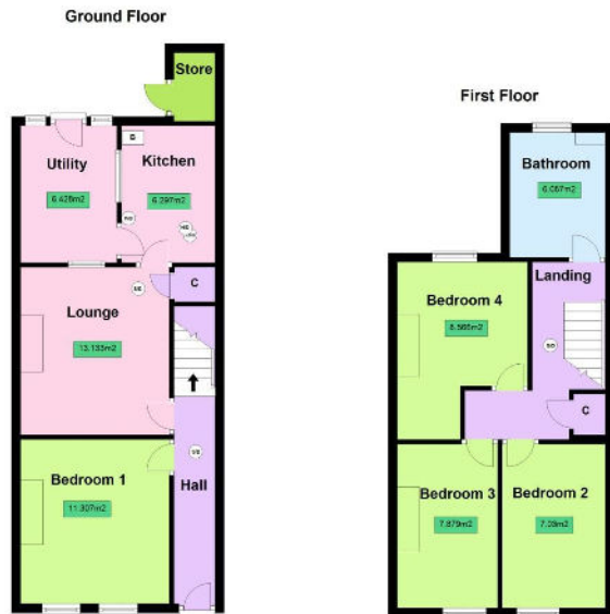
16 St Kildas Road, Bath