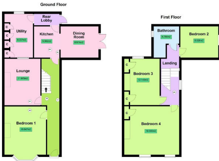
40 Lorne Road, Bath