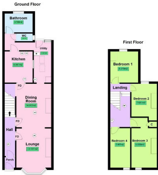
31 Coronation Avenue, Southdown, Bath