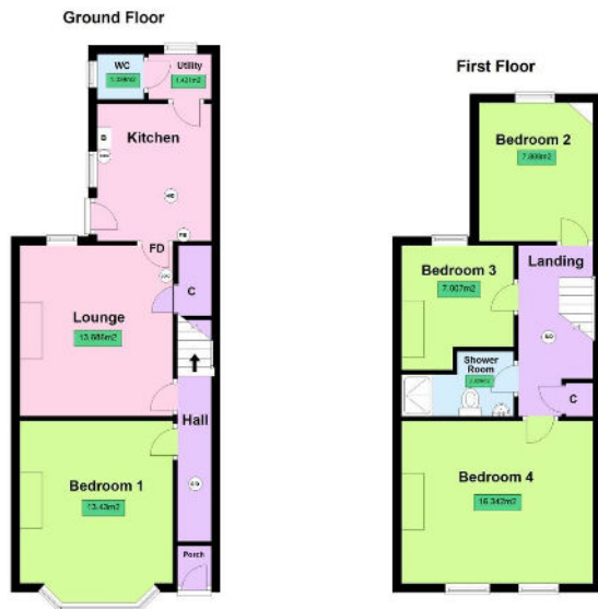
5 Lansdown View, Bath