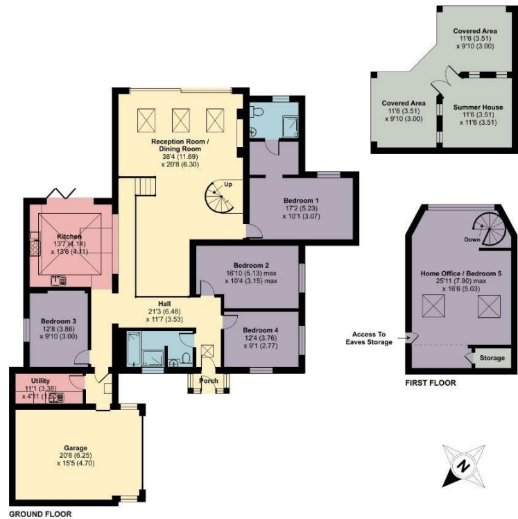
Floor plan produced in accordance with RICS Property Measurement 2nd Edition, incorporating International Property Measurement Standards (IPMS2 Residential). ©nrichcom 2025. Produced for Zest Sales and Lettings Ltd. REF: 1371407