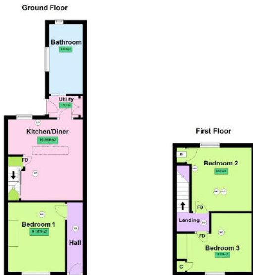
34 Brougham Hayes, Oldfield Park, Bath