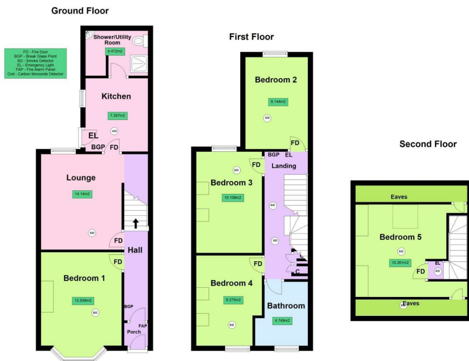
71 Beckhampton Road, Bath

VIEWING AND OFFER PROCEDURE: If you wish to view this property, please contact our office on the number provided. All offers on this property should be made through this office. In order to fulfill our responsibilities to the seller, when offering on this property, you will be asked a series of questions about how you intend to fund the purchase and whether or not your offer is dependent on the sale of another property. This information provided by you, along with the amount of your offer, will then be forwarded onto the seller for consideration.