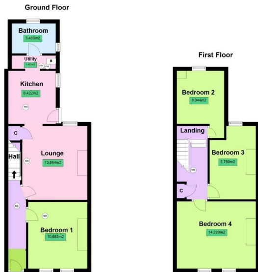
10 Coronation Avenue, Southdown, Bath