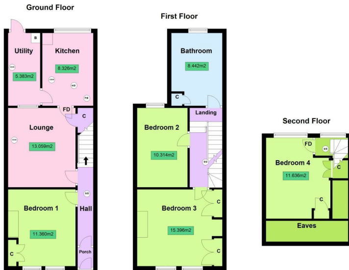
24 Mayfield Road, Bath