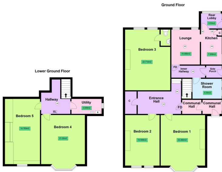
GF Flat 84 Newbridge Hill, Bath