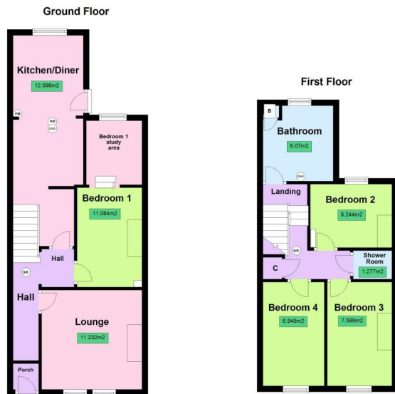
58 Caledonian Road, Bath