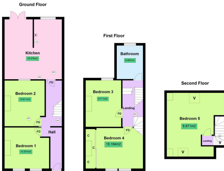
27 Claude Avenue, Bath