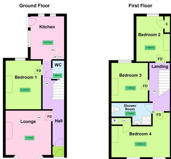
8 Third Avenue, Bath