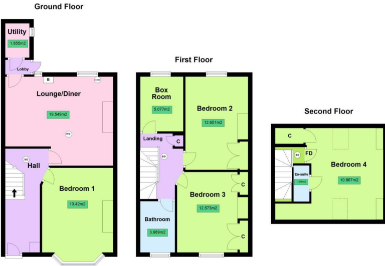
5 Oldfield Lane, Bath