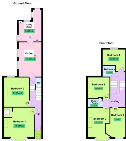
24 Victoria Road, Bath