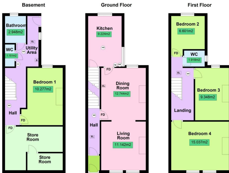
138 Coronation Avenue, Bath