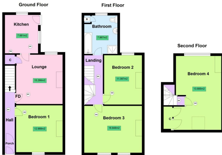
39 Caledonian Road, Bath