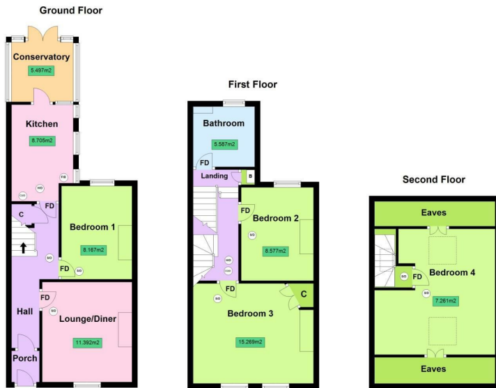
31 Dartmouth Avenue, Bath